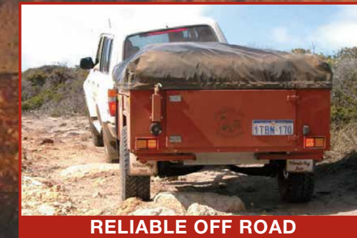
RELIABLE OFF ROAD